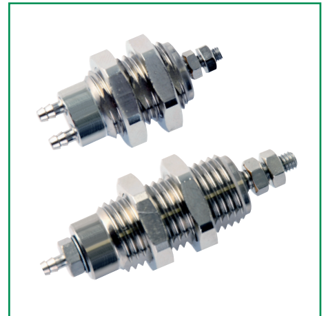
Extend force at 6 bar (daN)